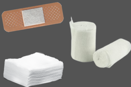
Absorbent materials with minimal blood