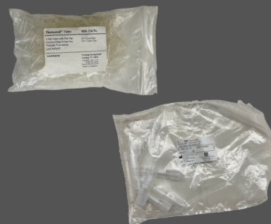
Empty plastic bags