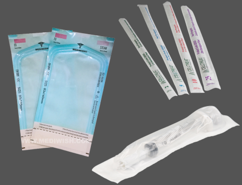
Soft plastic packaging