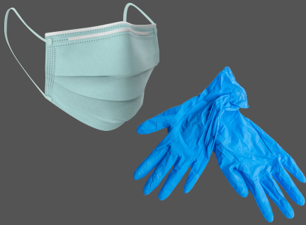
Masks, gloves and other PPE