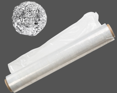
Plastic wrap and aluminum foil