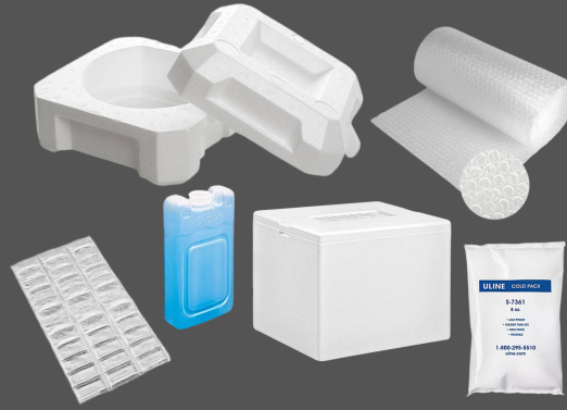
Styrofoam, bubble wrap, and ice packs