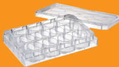
6/12/24/96 well plates