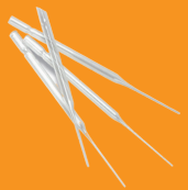
Glass pasteur pipettes