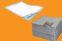
Contaminated absorbent pads