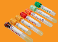
Glass vacutainer tubes