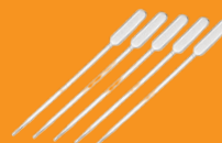
Plastic pasteur pipettes