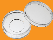
Glass bottom dish