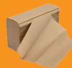
Contaminated paper towels